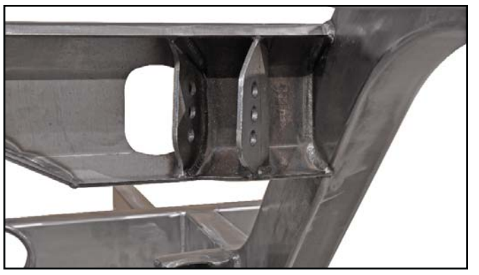
3-Position Upper Control Arm Mount

Multiple mounting points for each of the suspension components, including shocks, control arms, and anti-roll bar, enable highly adjustable suspension geometry that can be finetuned to match the performance requirements and weight distribution of your specific vehicle. Suspension component options include tubular-steel or billet-aluminum suspension links with pivot-ball ends, factory-welded FAB9™ housing, ball-end anti-roll bar, and VariShock coil-over or air-spring shocks.