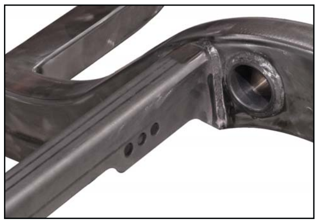
3-Position Upper Shock Mount