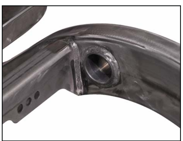
Anti-roll bar mounting sleeves are welded into the frame rail positioning the bar close to the undercarriage and clear of suspension and exhaust.