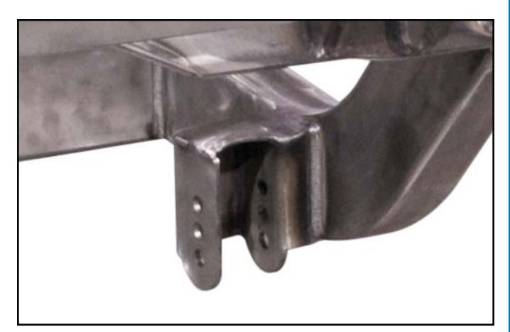
3-Position Lower Control Arm Mount