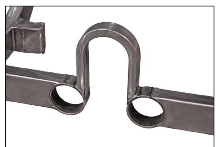
Tall driveshaft loop allows body to sit lower over the drivetrain without risk of driveshaft contact. Crossmember features factory-welded, dual 4"-ID exhaust ports.