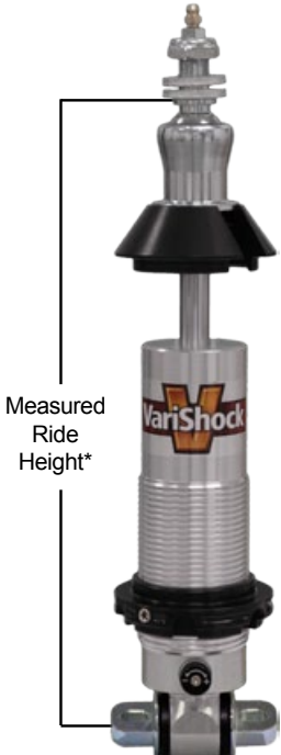
*Refer to Shock Specifications on page 2.

Drag race vehicles generally require more extension (rebound) travel to help weight transfer, and because the drag strip is very flat, less compression travel is needed. The amount of extension travel available in the shock will drastically affect how the car works. At baseline ride height, the shock and spring should collapse 60-percent from their installed heights. This results in 60-percent of travel available for extension and 40-percent of compression travel.