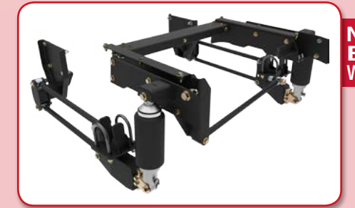
Air-Spring 4-Link Suspension