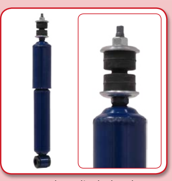
Steel Bodied Shock