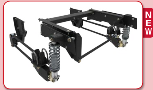
Coil-Over 4-Link Suspension