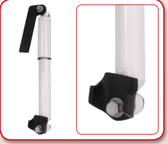
Weld-In Shock Relocaters