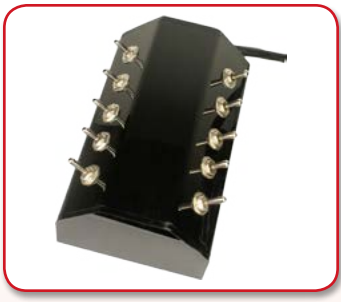
Mounted Switch Box