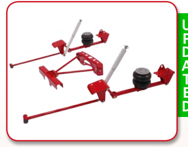
Chevy S-10 System