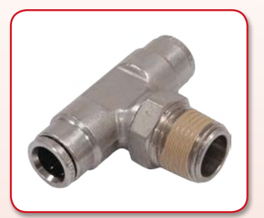
Male NPT, Branch Tees