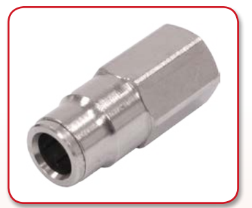
Female NPT, Straights