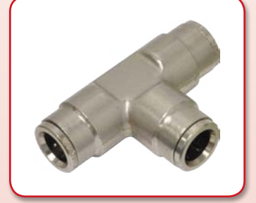
Tube, Tee Unions