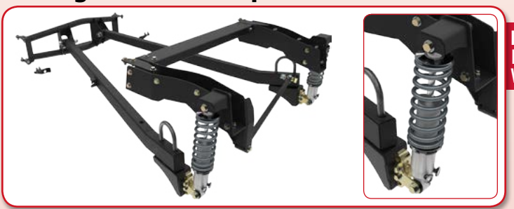
Coil-Over Trailing Arm Suspension