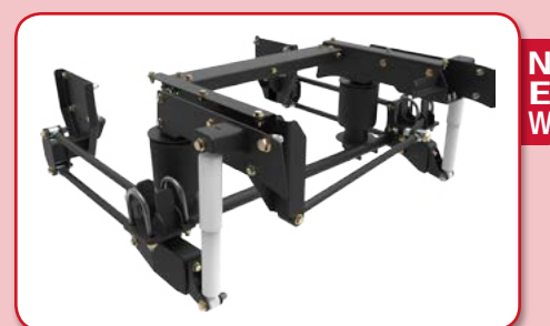
Air-Bag 4-Link Suspension