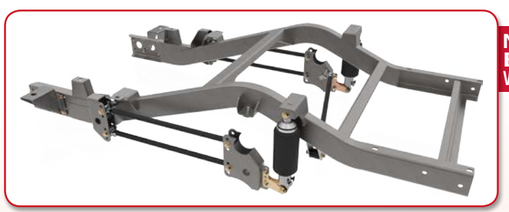
Thru-Bed Air-Spring Rear Frame Clip System