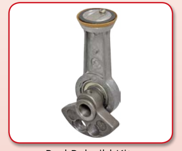
Rod Rebuild Kits