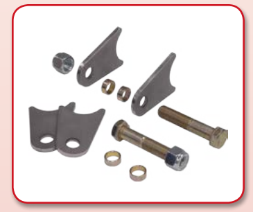
Shock Mount Tabs