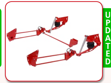
Ford F-150 System