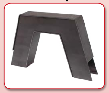
Weld-In Step Notch