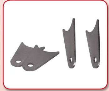
Canteliver Link Mounts