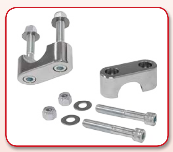
Stainless Lower Arm Clamps