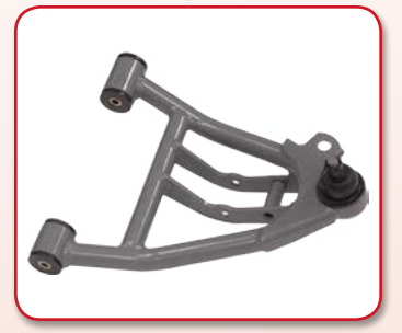
Lower Air-Spring Arms