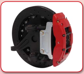
16" Big Brakes (Front)