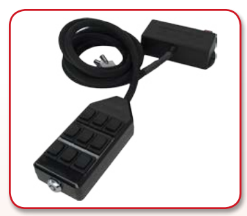
Hand-held Switch Box