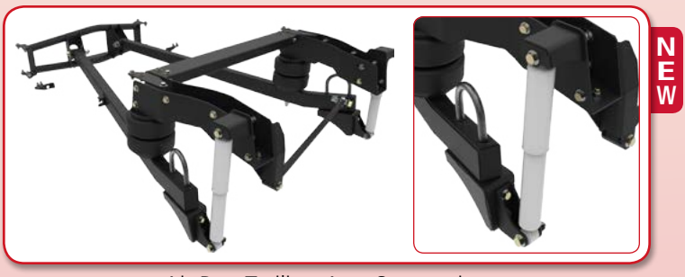
Air-Bag Trailing Arm Suspension