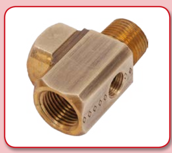
Gauge Port Run Tees