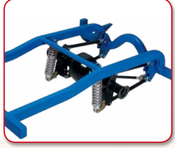
4-Link Frame System