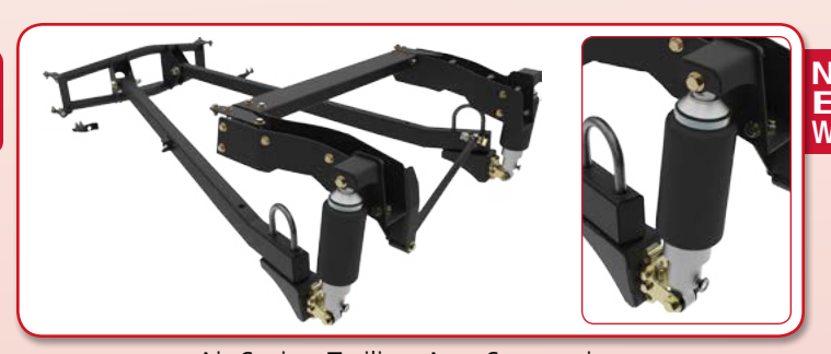
Air-Spring Trailing Arm Suspension