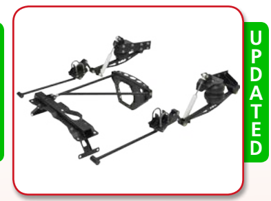
Ford Ranger System