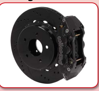
14" Big Brakes (Rear)