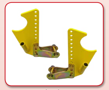
Lower Shock Mounts