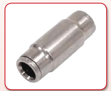
Tube Union, Straights