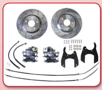
12" and 13" Kits (Rear)