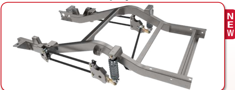
Thru-Bed Coil-Over Rear Frame Clip System