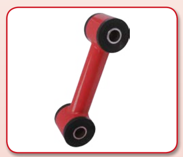
Canteliver Drop Links