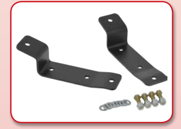
Dropped ARB Brackets