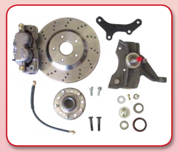
13" Kits (Front)