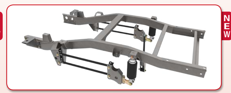
Under-Bed Air-Spring Rear Frame Clip System