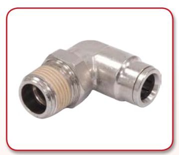
Male NPT, Elbows