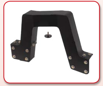
Bolt-On Step Notch