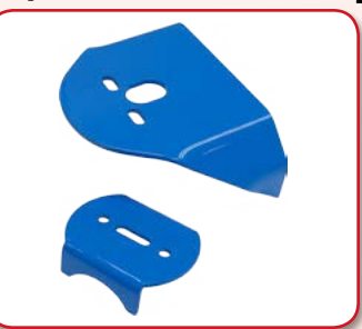
Over-Axle Bag Mounts