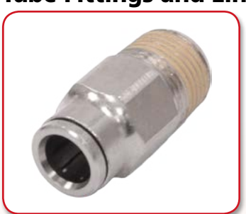
Male NPT, Straights