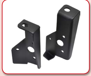
Bolt-In Shock Relocaters