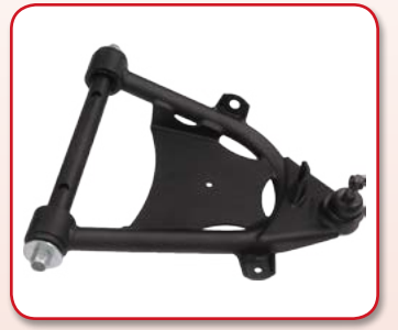
Lower Air-Bag Arms