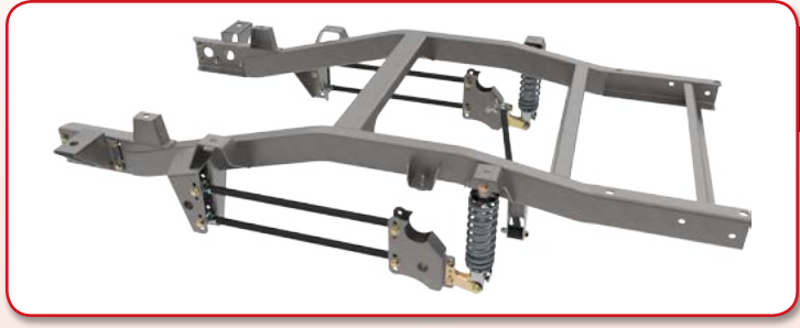
Under-Bed Coil-Over Rear Frame Clip System