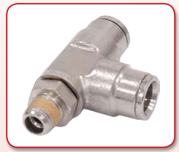
Male NPT, Run Tees