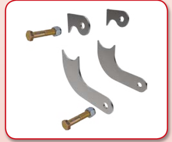
Shock Mount Set