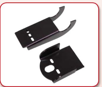
Behind-Axle Bag Mounts