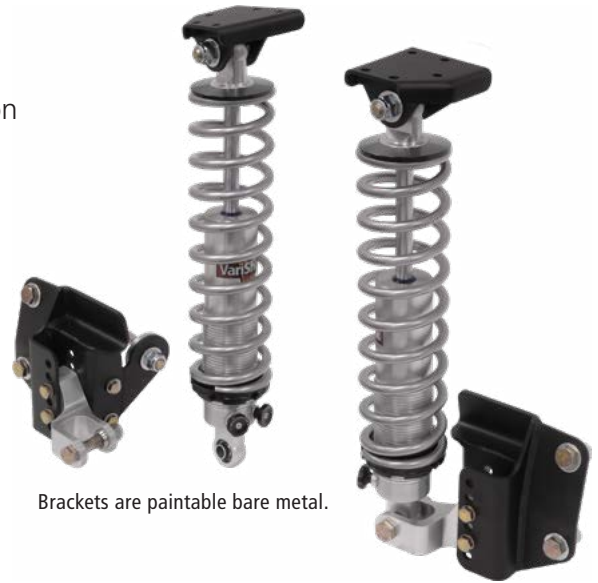
Brackets are paintable bare metal.