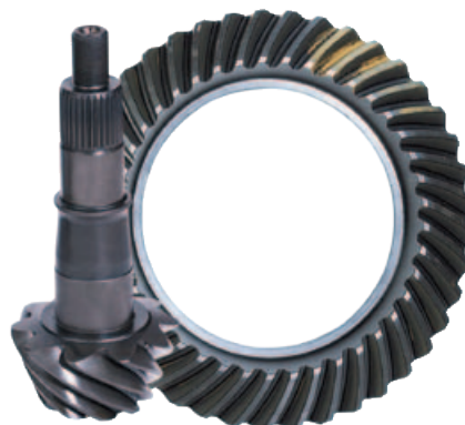
Available Gear Ratios

A wide selection of popular gear ratios is available with select ratios offered as an upgrade. Gears are manufactured from 8620 steel then heat-treated for hardness, durability, and extended service life. First choice for street/strip or road racing.