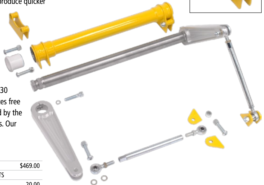
6262 AVENGER SPLINED ANTI-ROLL BAR $469.00 OPTIONS WIDTH 18" TO 36" IN ONE-INCH INCREMENTS AXLE-HOUSING MOUNT TABS (SET OF 4) 20.00