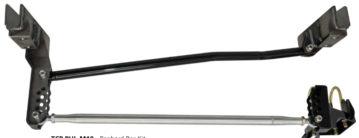
TCP PHL-M10 - Panhard Bar Kit

The essential components for fuctional use of the panhard bar are sold as its own kit and includes the two weld-on frame brackets, steel support tube, adjustable-length aluminum panhard bar, and passenger-side leaf-spring plate and panhard bar mount. This system can be used with the factory driver-side spring plate and existing anti-roll bar (clearance permitting).