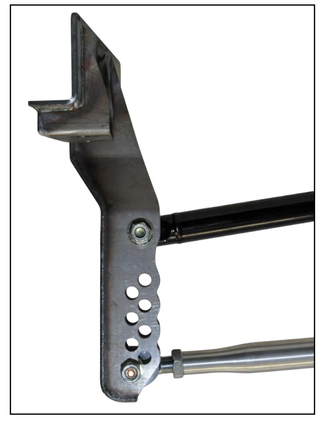
Lower Positions (understeer) - The lowest positions of adjustment tune toward a vehicle that understeers or pushes when cornering. This is considered to be a safe starting point.