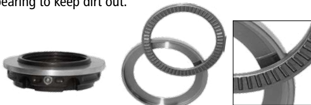
VAS 513-101 SPRING SEAT THRUST BEARING SET, ORIGINAL STYLE VAS 513-100 SPRING SEAT THRUST BEARING SET, DUST-SHIELD STYLE

Thrust bearings are used at the lower spring seat to reduce friction when adjusting ride height. New stainless "cap-style" seats, a VariShock exclusive, enclose the thrust bearing to keep dirt out.