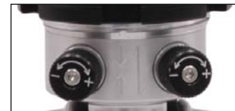
QuickSet 2 Double Adjustable