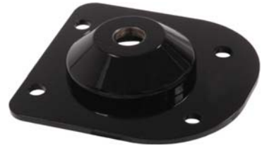
Shock Tower Back-up Plate