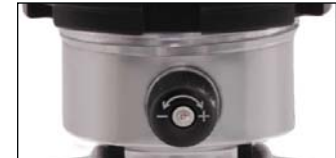
QuickSet 1 Single Adjustable