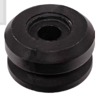
Progressive-Rate Foam Bump Stop