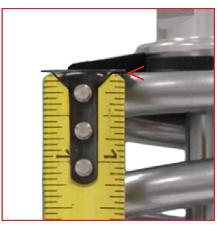
Hook the tape measure against the spring at the upper spring seat slot.

NOTE: The measured length may differ slightly from the nominal spring length. In our example the 9" VariSpring actually measures 8-15/16" when correctly installed.