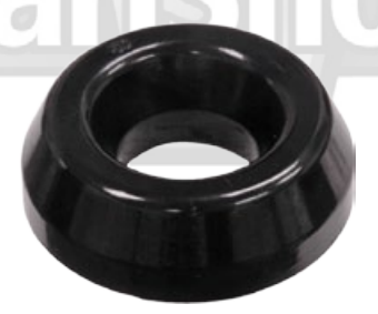
Standard VariStrut Bump Stop