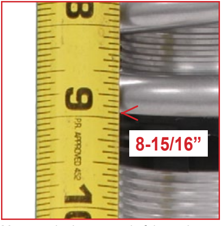
Measure the bottom end of the spring.