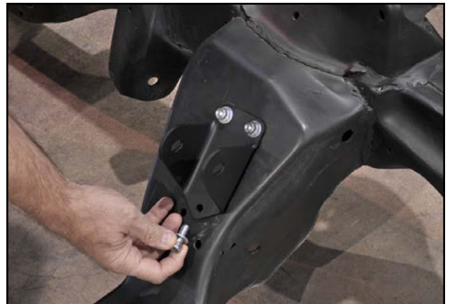
1970-71 Camaro/Firebird (F-Body)