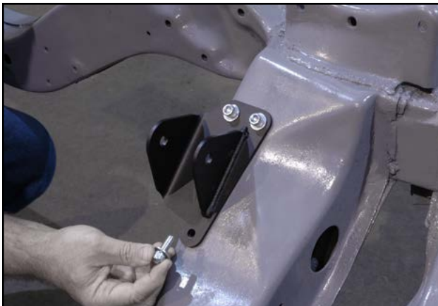
1967-69 Camaro/Firebird (F-Body)