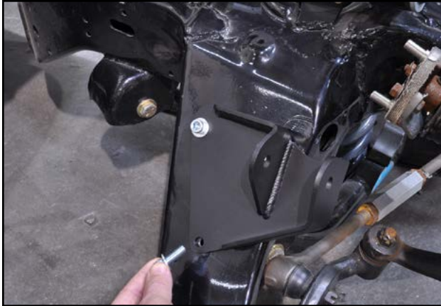
1964-67 Chevelle (A-Body)