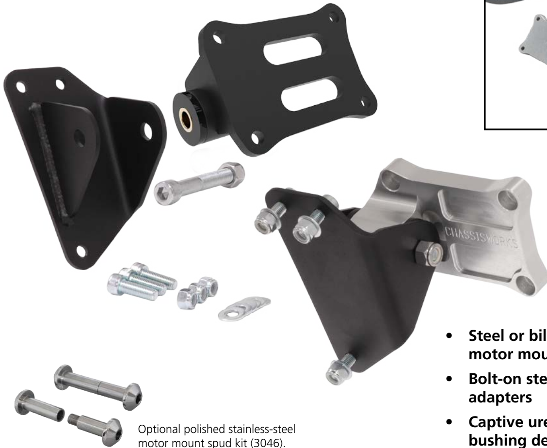
Optional polished stainless-steel motor mount spud kit (3046).