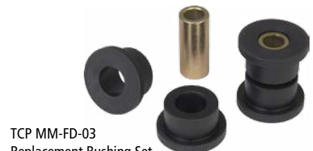
TCP MM-FD-03 Replacement Bushing Set Includes : 4 bushings, 2 sleeves

Our poly-urethane bushed motor mount assemblies provide a high performance, direct replacement alternative to bonded rubber factory mounts and are available for small block and big block applications. A unique, double-shear, through-bolt design eliminates any chance of motor mount separation during normal use. Fixed-style mounts use shims on either side of the urethane bushing to allow the fore/aft position of the motor to be varied within a 1/2" range centered at the stock position. Adjustable-style mounts (small-block only) feature a slotted engine plate allowing three inches of adjustment centered at the stock position. The mount features graphite impregnated poly-urethane bushings with seamless internal sleeve and external housing. Transferred vibration is increased over factory levels but without the harshness commonly found using completely solid mounts.