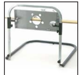
Bump Steer Gauge