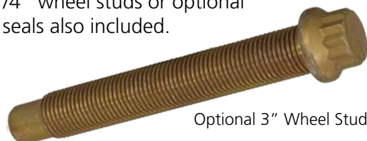
Optional 3" Wheel Stud

Billet aluminum hubs reduce unnecessary weight and allow components to be easily replaced if damaged or worn. Hubs are silver-anodized machine-finished with matching screw-on, O-ringed cap to prevent oxidation and resist scratching. Assemblies include both 4-1/2" and 4-3/4" five-lug bolt patterns with 1/2 x 2-1/4" wheel studs or optional 1/2 x 3" studs. Wheel bearings and seals also included.