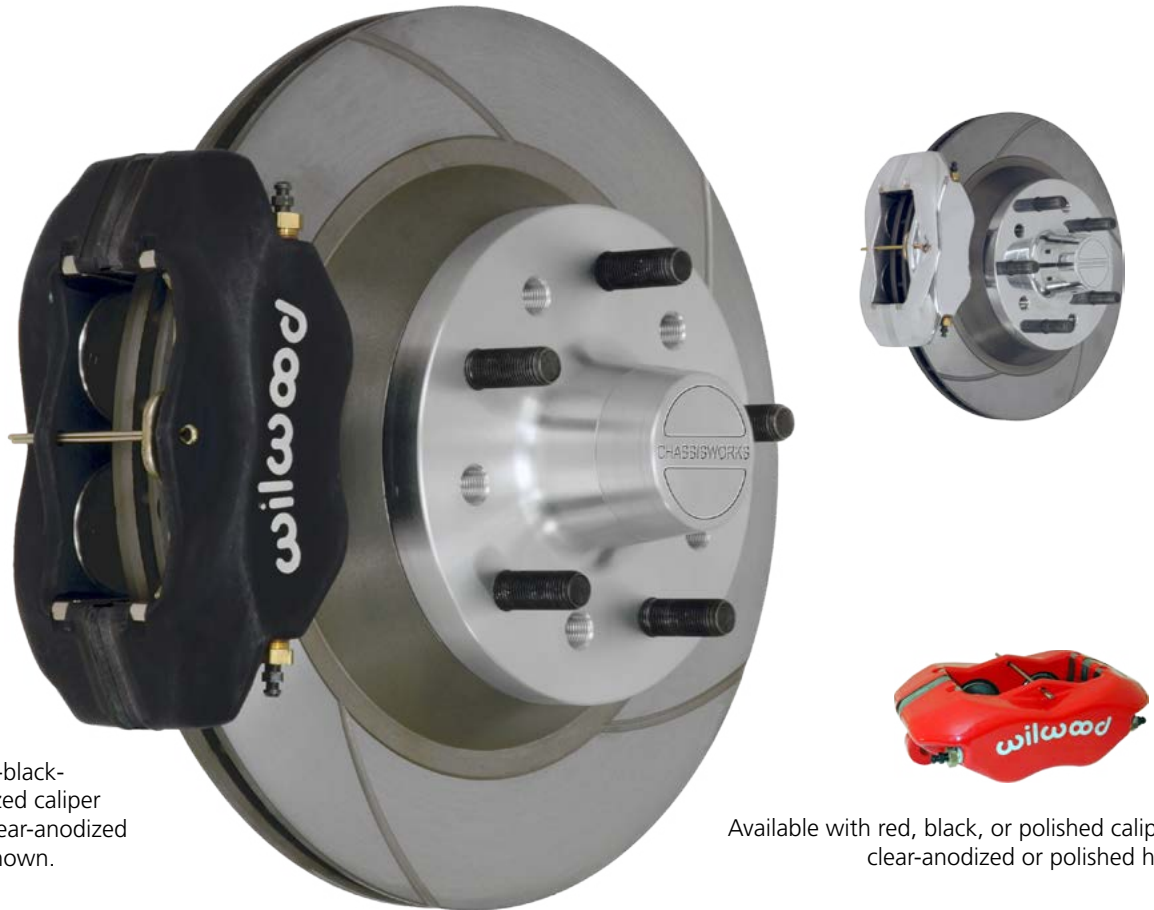
Matte-black-anodized caliper and clear-anodized hub shown.