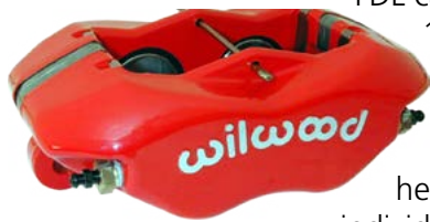
Optional red caliper

FDL calipers use one-piece, 1.75"-diameter, stainless-steel pistons and high-temperature, square-faced bore seals. Stainless steel slows heat transfer to the brake fluid and improves the system's resistance to heat-induced pedal fade. This reduction in heat also increases the service life of the fluid and seals. The four individual pistons apply pressure against both sides of the rotor. Caliper