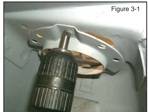
Figure 3-1 applies only to vehicles using carriage bolts to secure the factory upper shock mount.

Note: Fairlane shock towers use a slightly different bolt pattern and must be drilled to match the adapter and backup plates. Structural integrity is maintained through use of the backup plate.